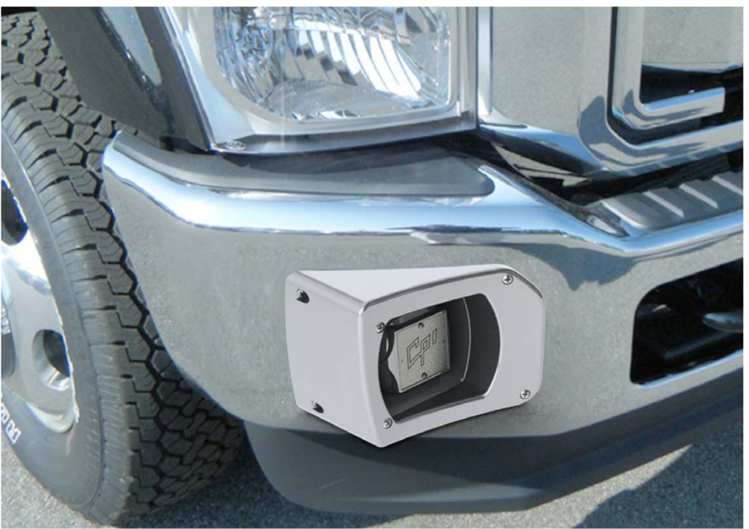
Passenger Side Speaker Placement