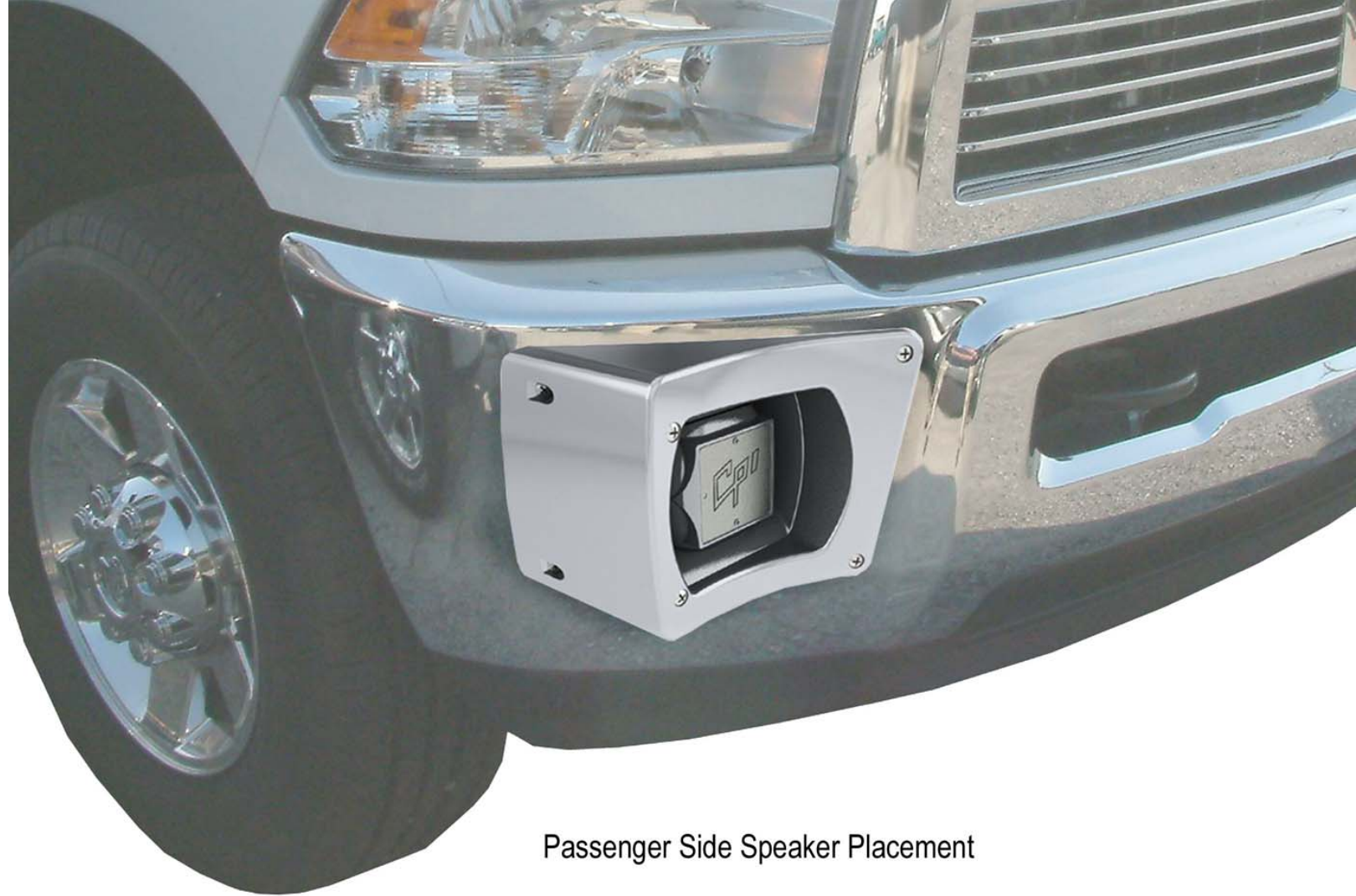
Passenger Side Speaker Placement